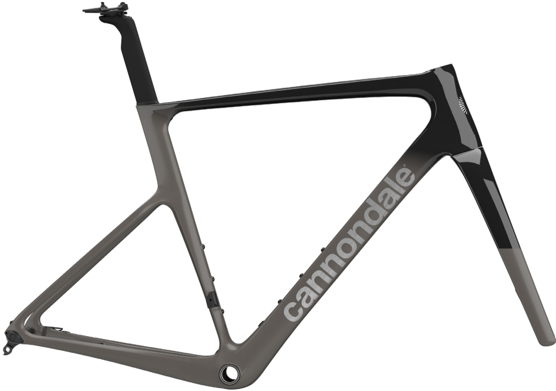
Rendering to show color only.