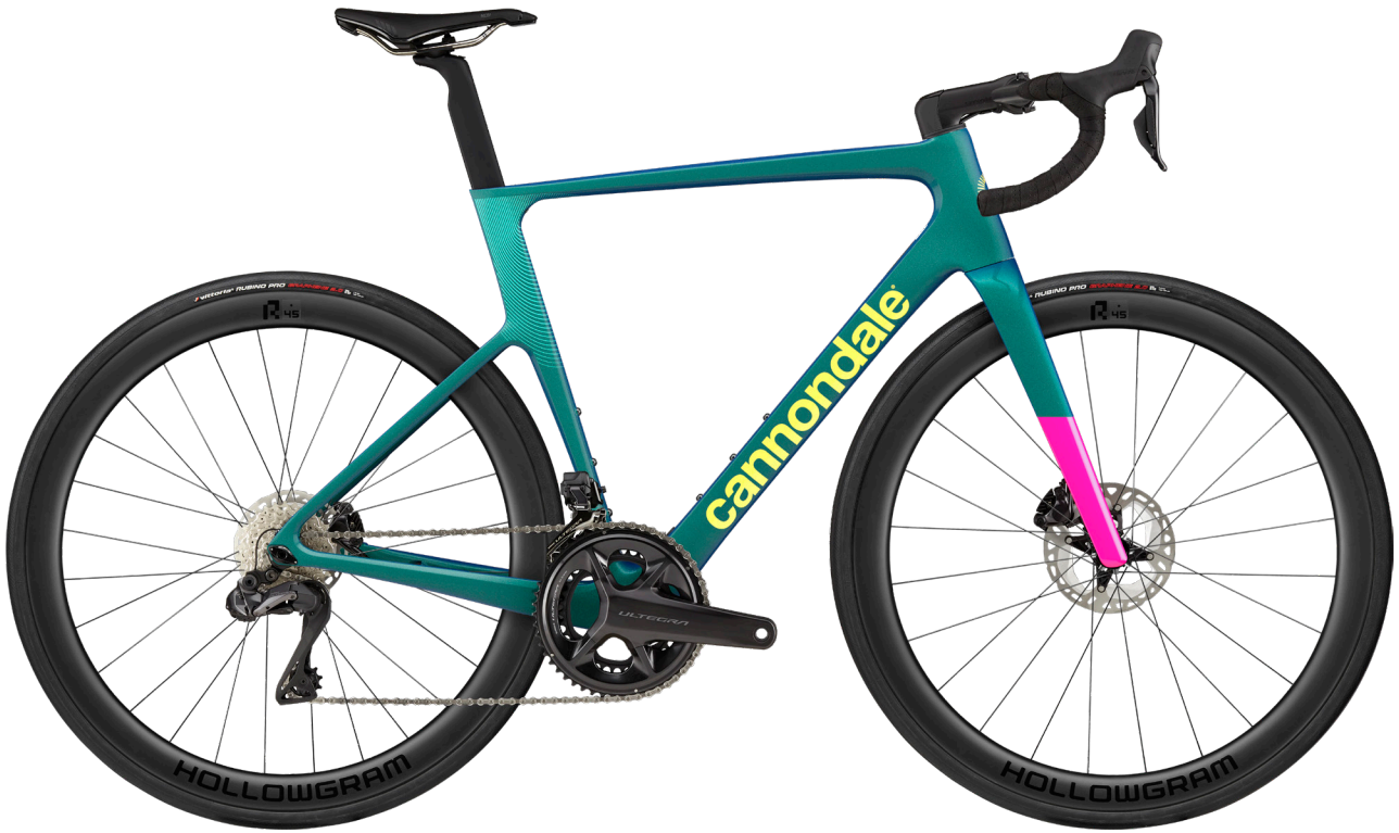
Rendering to show color only.